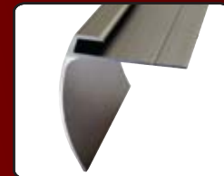
Stair Nosing • Available in 3 gauges