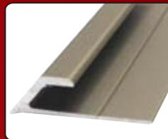
Reducer / Cap • Available in 3 gauges